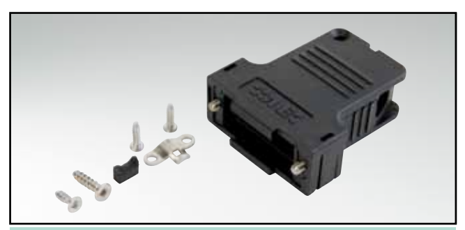
RoHS compliant - CSA listed, File No.: LR 115000-1 - UL listed, File No.: E202784