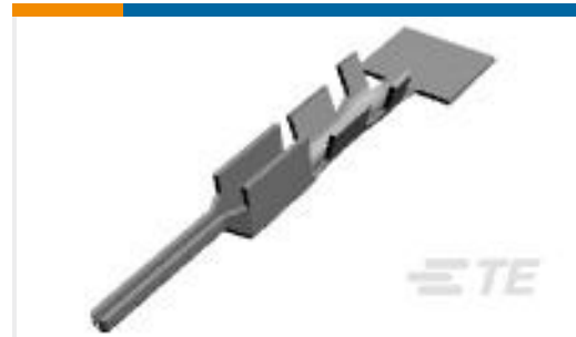
TE Part #1-794608-1 PIN CONT 20-24 15 GOLD STRIP