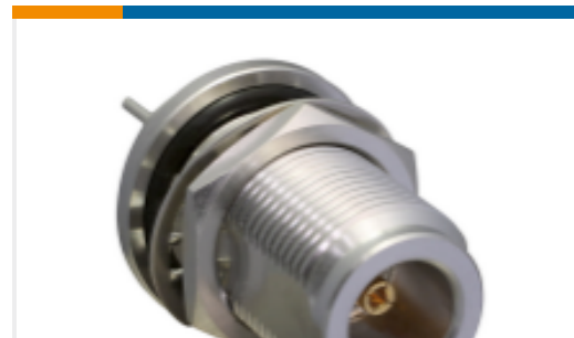
TE Part #CONN001-W N Type Jack 50 Ohm PCB Through Hole