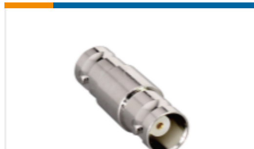
TE Part #ADP-BNCF-BNCF BNC Jack to BNC Jack