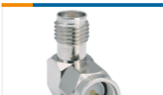
TE Part #CONSMA010 SMA Jack to SMA Plug RA