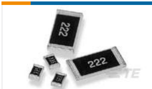
TE Part #1623133-1 CRG0805 1% 1K2