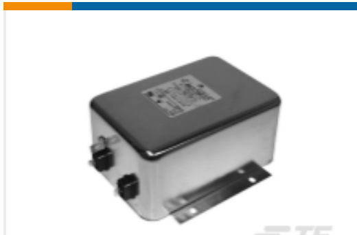
TE Part #6609046-7 Single Phase Filters, Corcom T Series