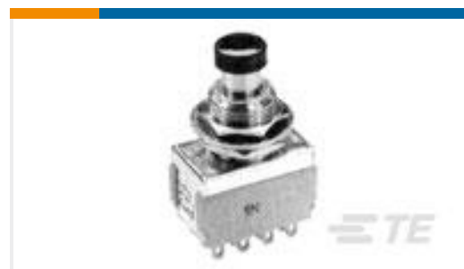
TE Part #5-1437567-8 MPG406R=(MSPG) SW PUSHBUTTON