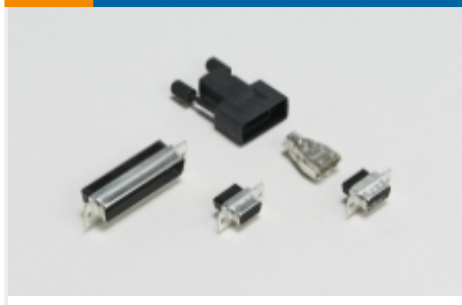
Crimp D-Sub Connectors(10)