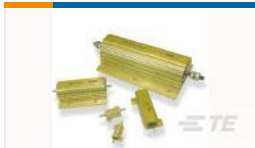
TE Part #5-1625963-5 HSA5 R10 5%