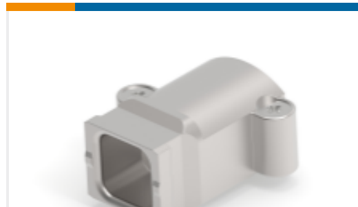
TE Part #1-2308272-4 CABLE CLAMP4 (CASE RAW)