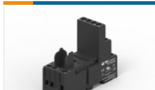
TE Part #1-1415526-1 PT78742