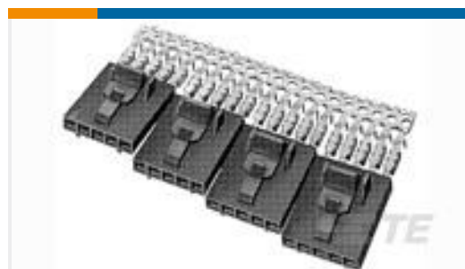
TE Part #1-103957-2 10X2 MTE RCPT SR LATCH .100CL