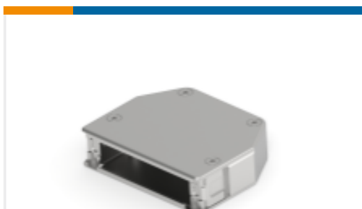
TE Part #1-2308327-1 FULL METAL HOODS SIZE 3 (1)