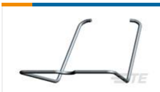
TE Part #5-1419111-9 PT28800