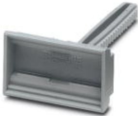
Terminal strip marker carrier, gray, unlabeled, mounting type: Plug in, lettering field size: 20 mm x 8 mm

Please be informed that the data shown in this PDF Document is generated from our Online Catalog. Please find the complete data in the user's documentation. Our General Terms of Use for Downloads are valid ( http://phoenixcontact.com/download )