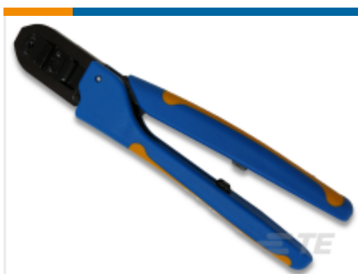
TE Part # 91542-1 CII TYPE III+ PIN SKT 24-22 ASSY