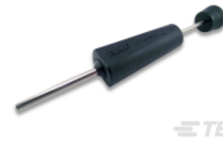
TE Part # 305183 EXTRACT TOOL TYPE 2 20-16