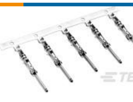
TE Part #66098-8 III+ PIN, 18-16, 15AU/FL, STRIP