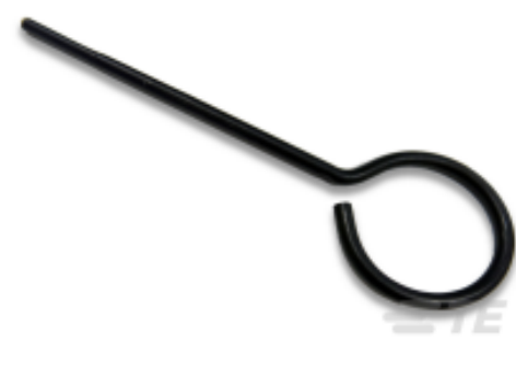
TE Part # 200893-2 INSERTION TOOL CONT