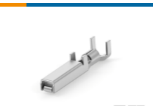
TE Part #917512-2 Contact: Component To Wire; 15A, 28-14 wire size