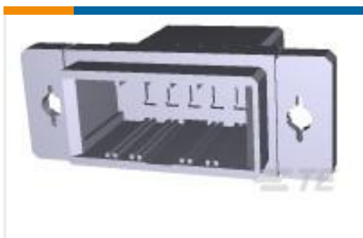
TE Part #178803-5 DYNAMIC D3100D TAB HSG PM 10P