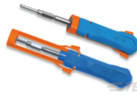
TE Part # 539972-1 EXTRACTION TOOL