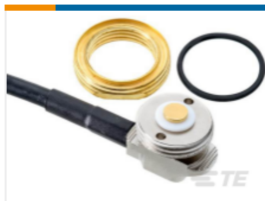
TE Part #NMOHPC MOUNT, HPM,3/4 NO CABLE