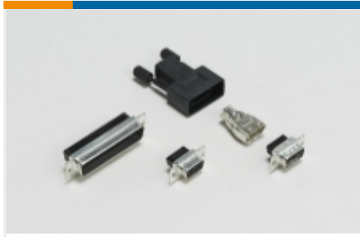
Crimp D-Sub Connectors(10)