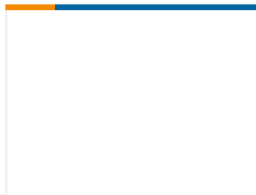
TE Part #ROB21 SUB, MISCACC, RW, 21in