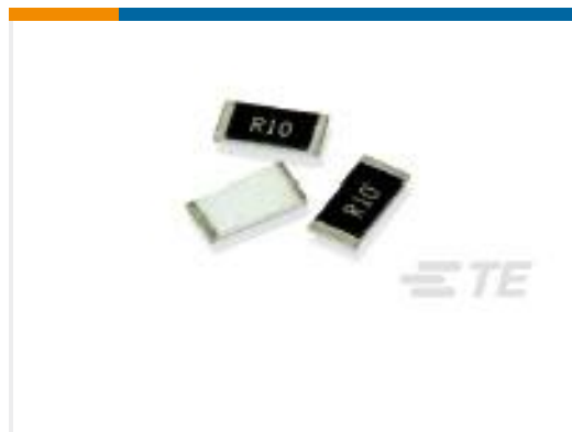
TE Part #2-2176058-7 RLP73K 3A R12 5% 2K RL