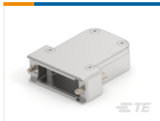
TE Part #1-2308341-1 FULL METAL HOODS SIZE 2