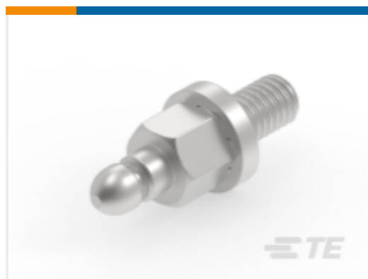
TE Part #1-2308265-7 QL SET FOR VARIANT B 7