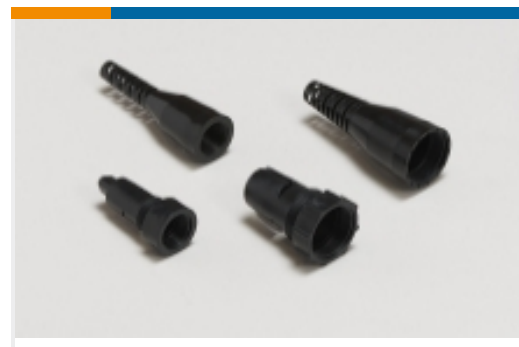
Connector Strain Relief(67)