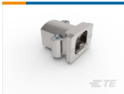
TE Part #1-2308272-2 Cable Clamp for Size 1-3 STD/1-4 QL Shell