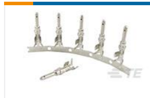
TE Part #1060-12-0222 PIN, SF, SIZE 12, 10, NI/NI