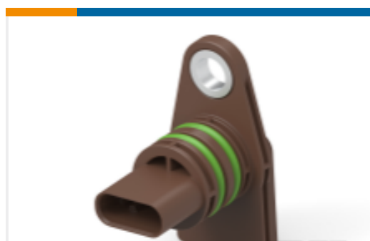
TE Part #2342926-1 4POS,MCON 1.2,TAB HSG ASSY,SLD