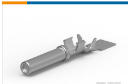
TE Part #1060-14-0122 DEUTSCH Size 16 Crimp Contacts