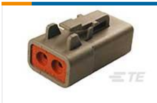
TE Part #DTP06-2S PLG, 2P, GRY, N