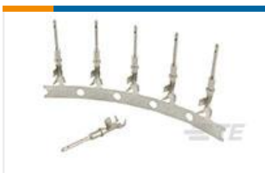
TE Part #1060-20-0122 PIN, SF, SIZE 20, 16-22, NI/NI