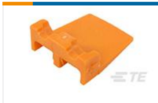
TE Part #WP-2P WEDGE LOCK, 2P, REC, ORG, DTP