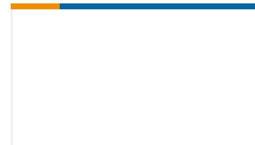
TE Part #554043-3 STD OFF, MTG STUD, HEX HD