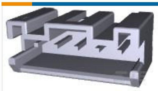
TE Part #1376478-5 2.5MM SIGNAL MATE CONN HEADER