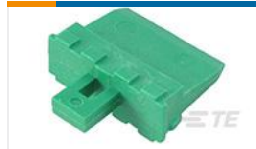
TE Part #W8P WEDGE LOCK, 8P, REC, GRN, DT