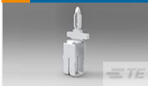
TE Part #1247002-2 MAGMATE "300 SERIE" WITH MULTISPRING PIN