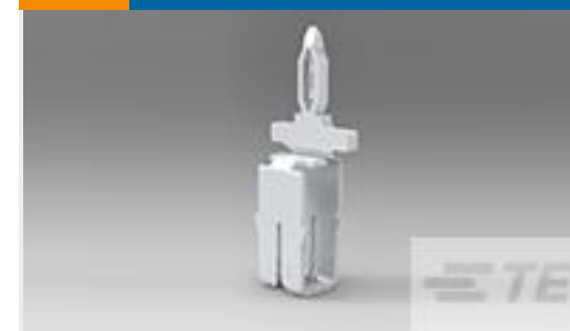
TE Part #1247003-2 MAGMATE "300 SERIES" W/H MULTISPRING PIN