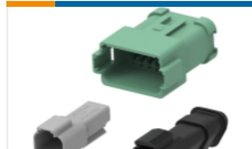
TE Part #DT04-08PB-P021 DEUTSCH DT Receptacle Connectors