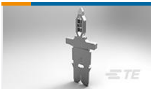
TE Part #2120745-2 MAG-MATE Slim Line with Multispring