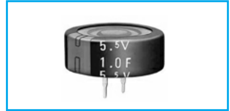
Marking color : White print on an indigo sleeve