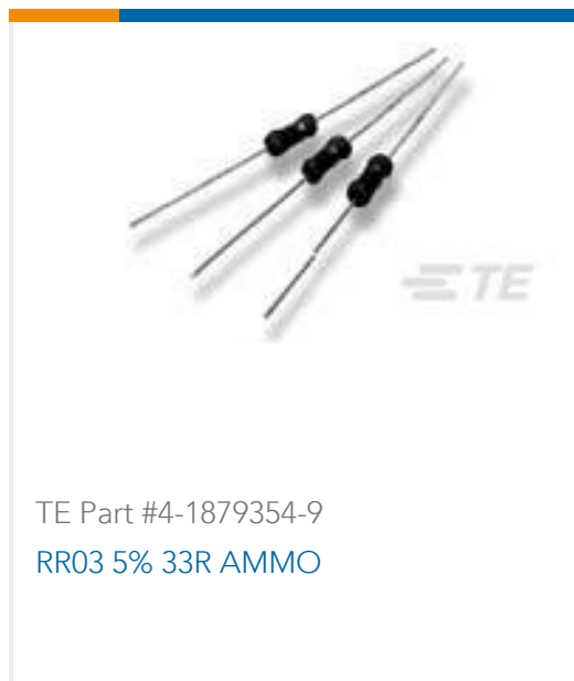
TE Part #4-1879354-9 RR03 5% 33R AMMO