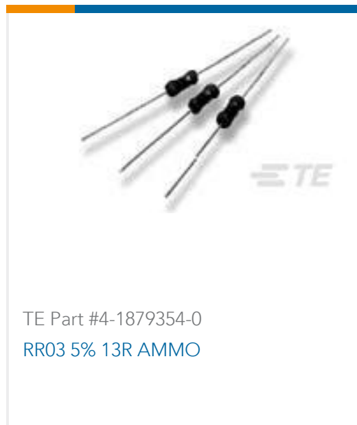
TE Part #4-1879354-0 RR03 5% 13R AMMO