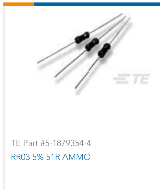
TE Part #5-1879354-4 RR03 5% 51R AMMO