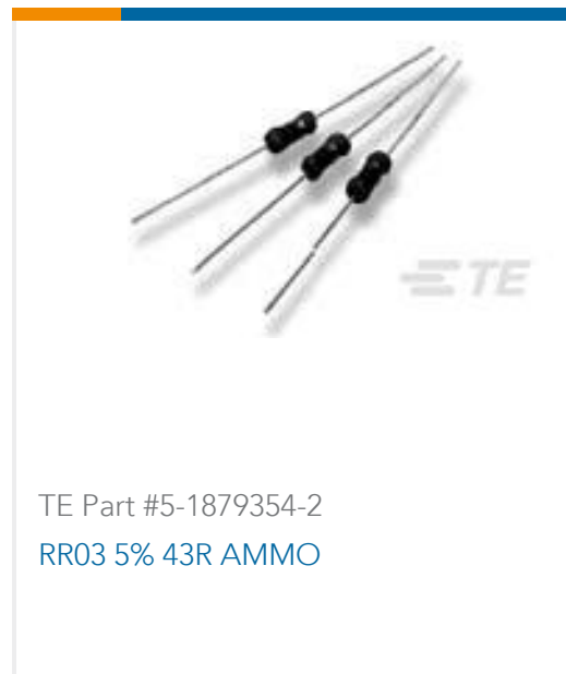
TE Part #5-1879354-2 RR03 5% 43R AMMO