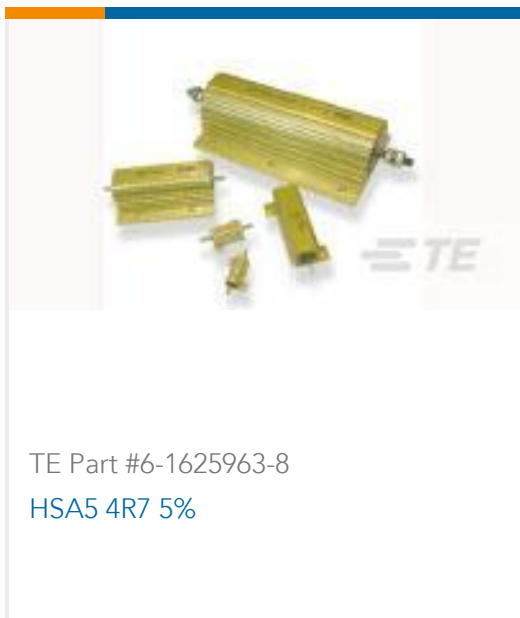
TE Part #6-1625963-8 HSA5 4R7 5%