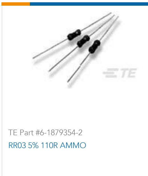
TE Part #6-1879354-2 RR03 5% 110R AMMO