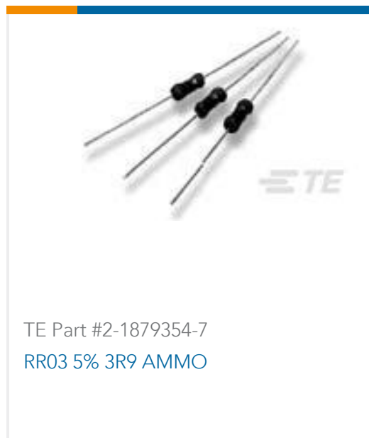
TE Part #2-1879354-7 RR03 5% 3R9 AMMO