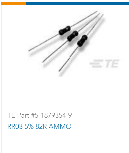
TE Part #5-1879354-9 RR03 5% 82R AMMO