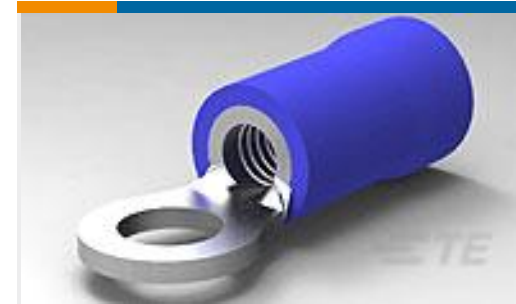
TE Part #34158 TERMINAL,PG R 16-14 6