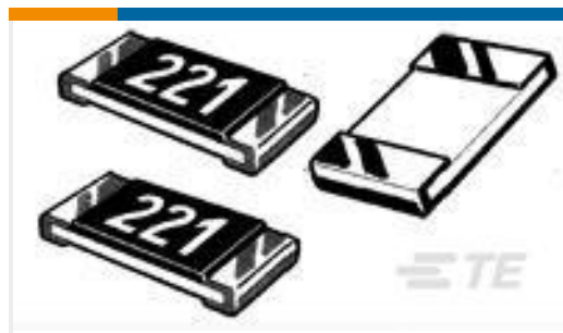
TE Part #1-2176230-9 3522 27R 5% 3W