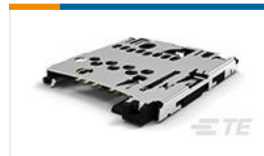
TE Part #2201778-1 MICRO SD PUSH PUSH LOW PROFILE TYPE