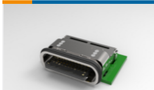
TE Part #2305018-2 USB TYPE C, REC IPX8 ON BOARD DUAL SMT