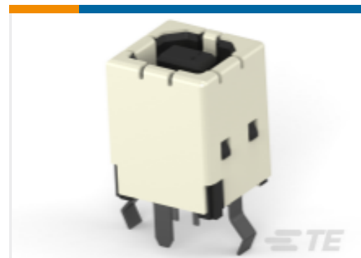
TE Part #5788336-1 STD USB TYPE B, VERTICAL, T/H