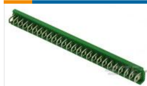
TE Part #1-5164713-3 13P.MINI-MATCH ASSY