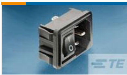
TE Part #1-1609112-3 15CBS1=F8273