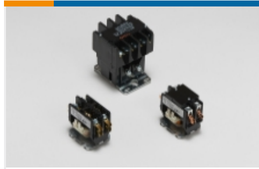
Definite Purpose Contactors(1)