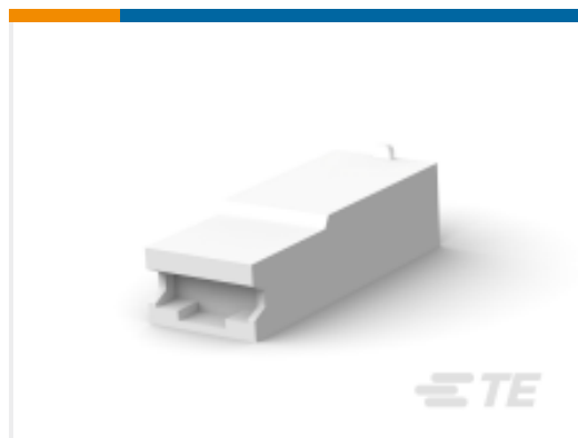
TE Part #341300 PL 250 REC HSG 1P NYLON NAT