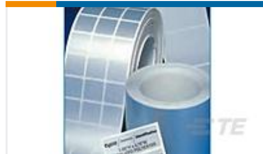
TE Part #A77951-000 WP-064064-25-9