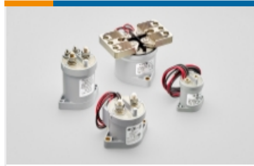
General Purpose Contactors(4)