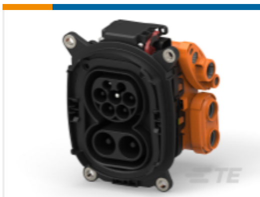
TE Part #2388502-2 CHARGE INLET, COMBO 2, LED, 90 DEGREE