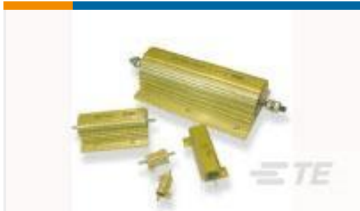
TE Part #1630024-1 HSC250 100R 5%