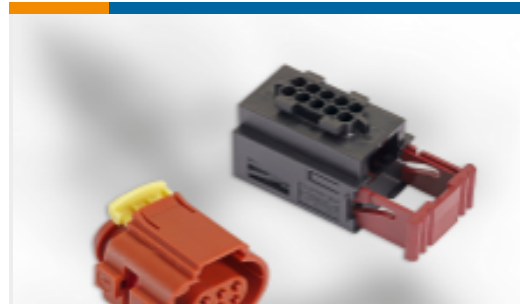
TE Part #1-967630-5 Timer Connector Housing