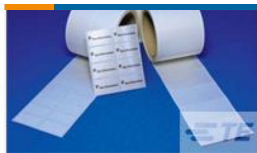
TE Part #6-1768018-2 EET-1938P-8A