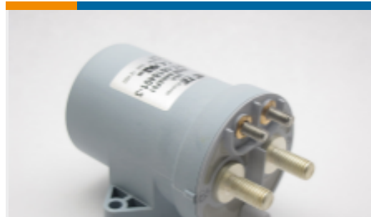
TE Part # 3-1618389-2 LEV200H4ANF=RELAY, SPST-NO