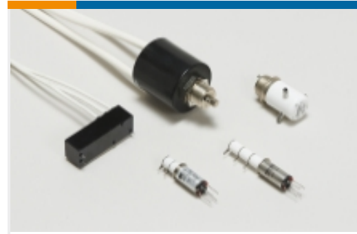
High Voltage Relays(13)