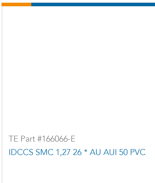
TE Part #166066-E IDCCS SMC 1,27 26 * AU AUI 50 PVC