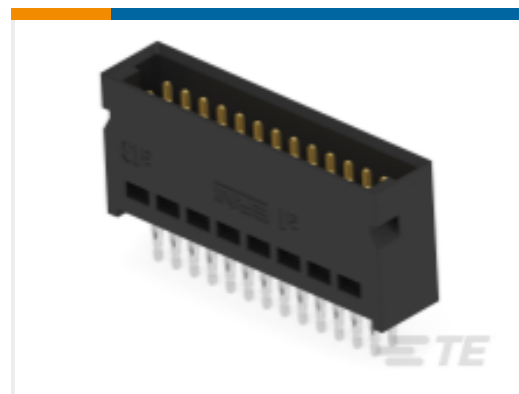
TE Part #064003-E SMCQ 26 M AB VV 3-04 * 2,8 0003 137 E001