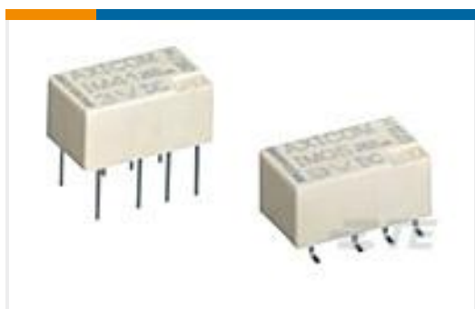
TE Part #5-1462037-4 IM41GR=IM RELAY 100mW 3V BIS