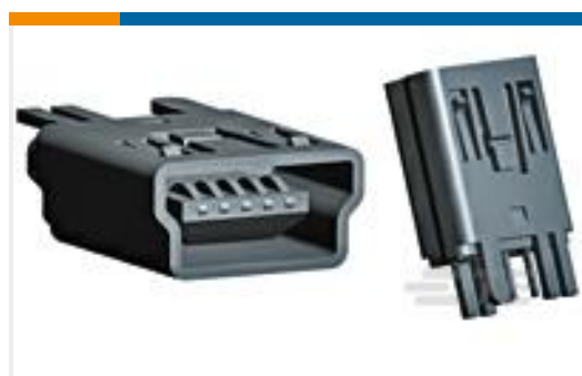
TE Part #1734753-1 MINI USB, TYPE B, VERTICAL, T/H