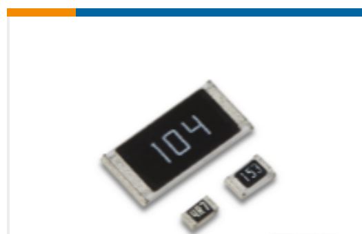
TE Part #2-2176337-5 CRGCO 0402 1K0 1%