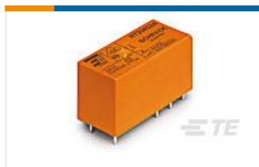
TE Part #3-1393239-6 RT174005