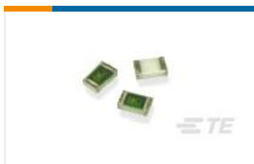
TE Part #7-2176087-2 RP 1J 0.166W 383R 0.1% 25PPM 1K RL