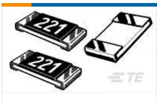
TE Part #2176070-7 3521 18R 1% 2W