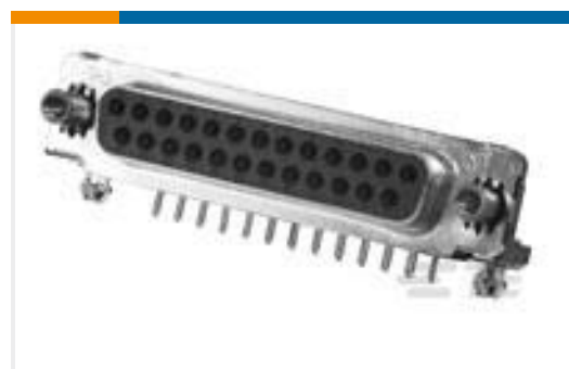
TE Part #5747844-3 09 MSFL RCPT RA 318 (IN,FM,BL)