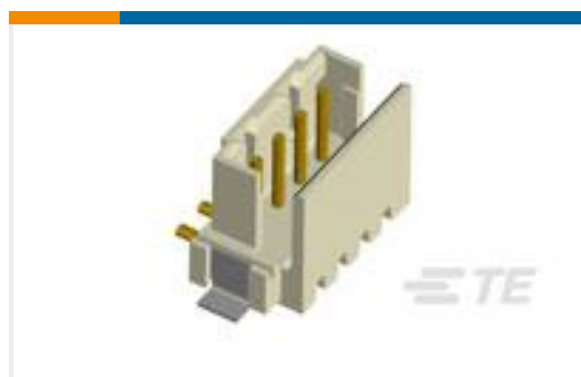
TE Part #292174-4 CT BOX HDR V SMT 4P O/TAPE NAT