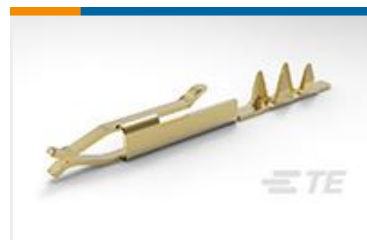
TE Part #1-487547-1 FFC,RCPT CONTACT,.050" CNTRLIN