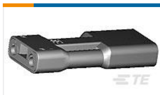
TE Part #2106136-2 Assembly, Receptacle, 2-Position