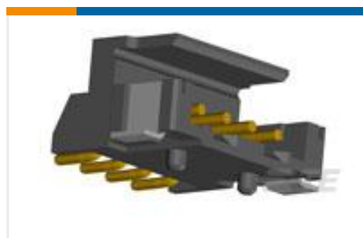
TE Part #292173-6 CT BOX HDR H SMT 6P O/TAPE BLA