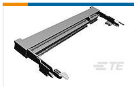
TE Part #1717254-1 EMBOSS ASS'Y DDR SODIMM SOCKET