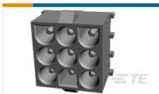
TE Part #350712-1 09P UMNL PIN HDR ASSY 94VO