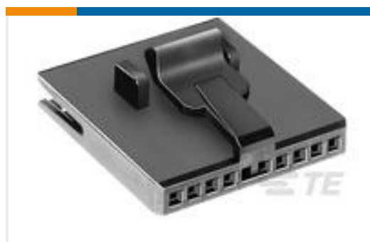
TE Part #1-487545-7 020 HOUSING FFC RCPT 050CL SR