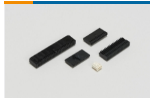
Wire-to-Board Connector Assemblies & Housings(5)