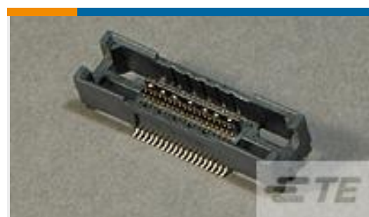
TE Part #2-5767004-2 MICTOR RECEPT ASSY, 38 POS.