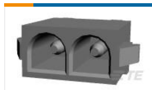
TE Part #350786-1 02P UMNL HDR ASSY 94VO