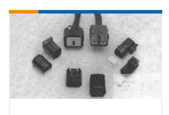
TE Part #345259-1 ANTI-BACKOUT 6WAY TAB HSGECONO