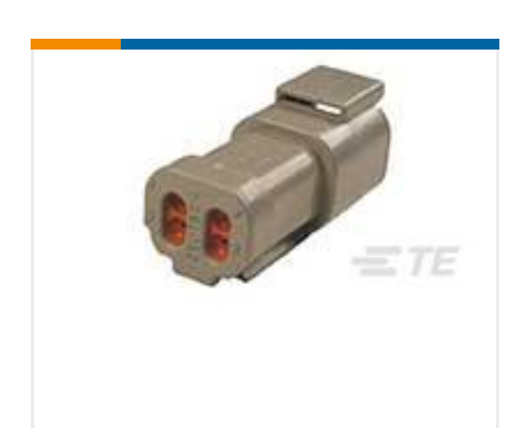
TE Part #DTM04-4P-E003 REC, 4P, GRY, N, CAP